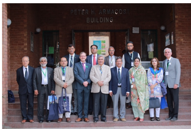
Group Photo of Participants AVH Foundation